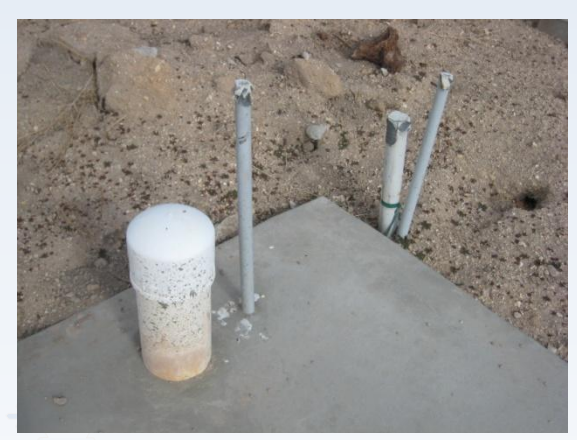
Stub outs for electrical and water conduits