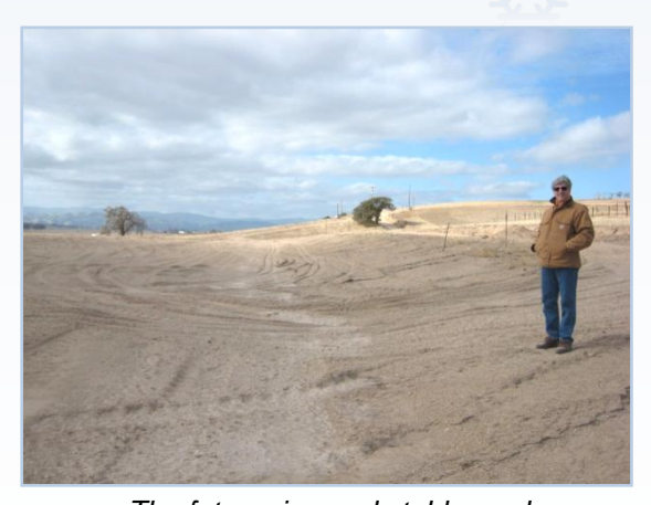
The future ring and stable yard

WE WISH VERY HAPPY HOLIDAYS AND A PROSPEROUS NEW YEAR TO ALL!